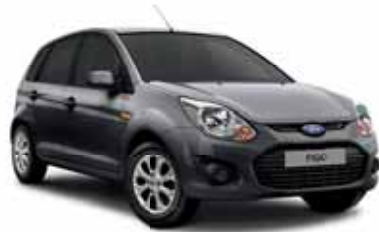
Sea Grey Metallic