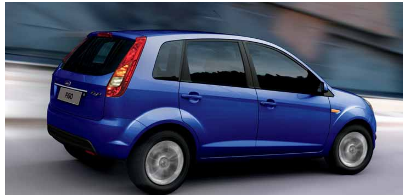
Trend, Kinetic Blue Metallic. Available equipment.

1 Limited availability. 2 Late availability. Colors are representative only. See your dealer for actual paint/trim options.