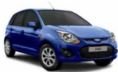
Kinetic Blue Metallic