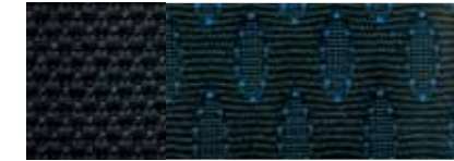
2 Jacob Blue Cloth with Cellular Blue Inserts