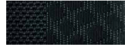
1 Jacob Dynamic Cloth with Contour Dynamic Inserts