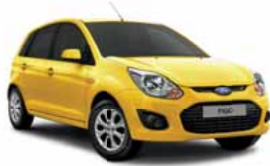
Bright Yellow Metallic