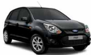
Panther Black Metallic