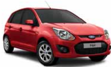
Paprika Red Metallic