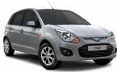
Moondust Silver Metallic